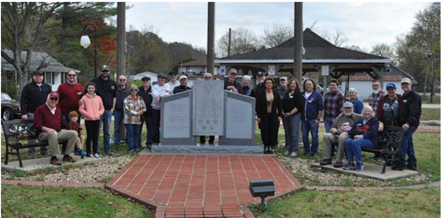
Veterans Memorial, Prairie du Rocher